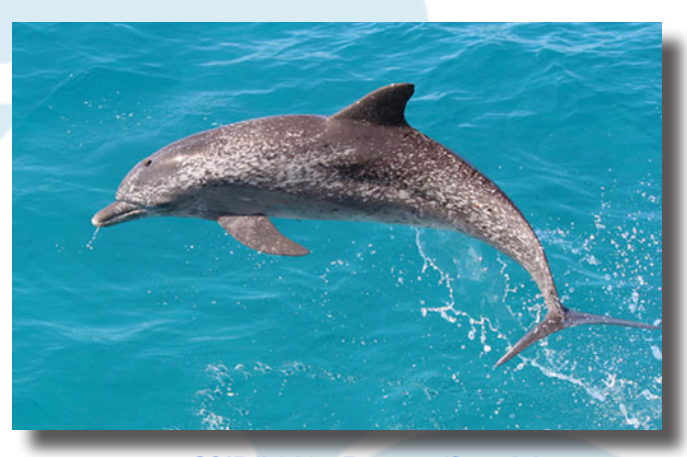
Sf ID# 010 - Romeo (female)