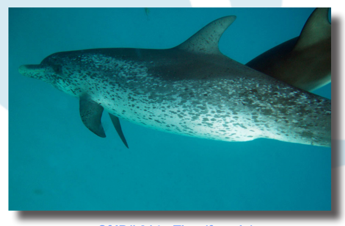
Sf ID# 014 - Tina (female)