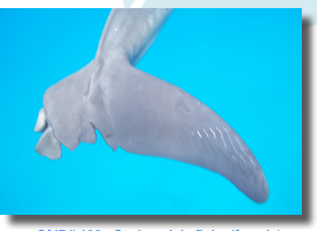
Sf ID# 106 - Seabeagle's fluke (female)