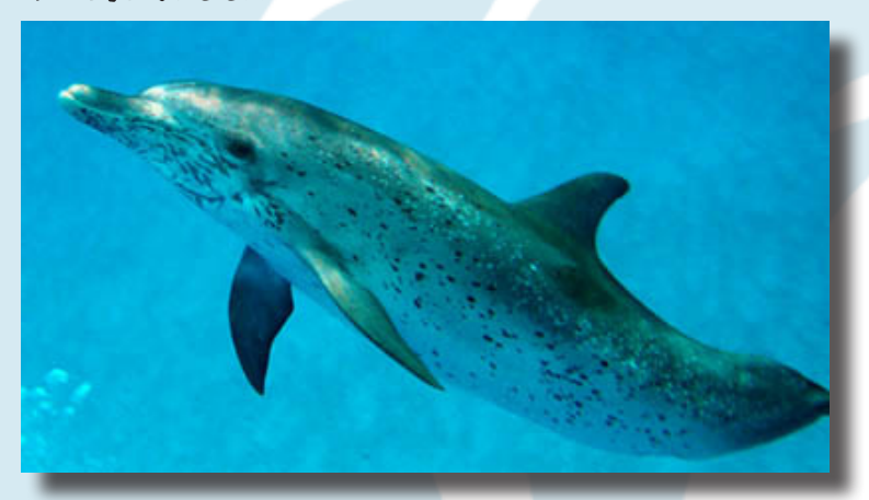
Sf ID# 069 - Tim (male)