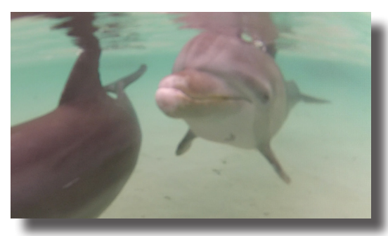
Dolphins checking out the MVA2!