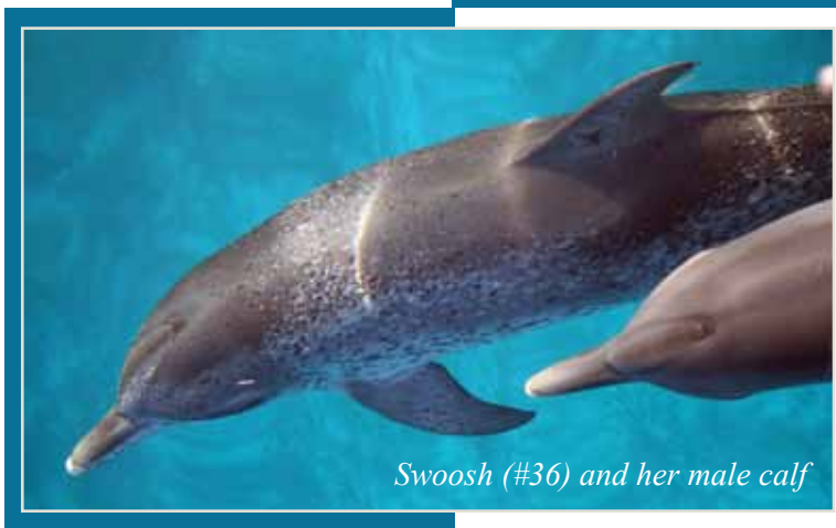
Swoosh (#36) and her male calf